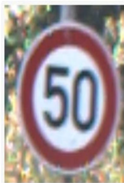
Predicted Traffic Sign is: Speed limit (50km/h)

The model will process the captured traffic sign and the predicted result will be shown on dashboard of a car in following manner.