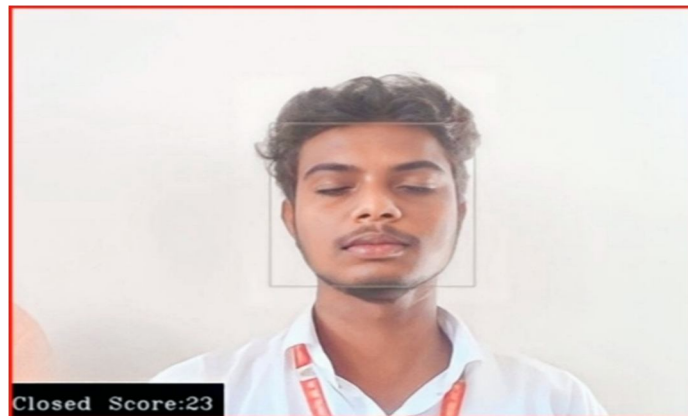
Figure.4.3 Eyes Closed and drowsiness detected

The model detected as Eyes are closed but score is less than threshold value. Alarm plays when score exceeds threshold value.