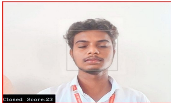
Figure.4.3 Eyes Closed and drowsiness detected

The model detected as Eyes are closed but score is less than threshold value. Alarm plays when score exceeds threshold value.