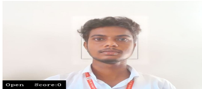
Figure.4.1 Eyes Opened

The result of the Driver Drowsiness detection is shown in the figures below-