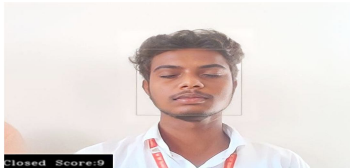
Figure.4.2 Eyes Closed

The model detected as Eyes are Open and score is zero, it indicates driver is not fatigue.