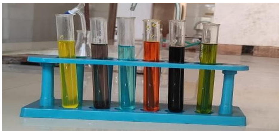
Fig. 5 Phytochemical test

(“+” Indicates positive; “-” indicates negative) [5]