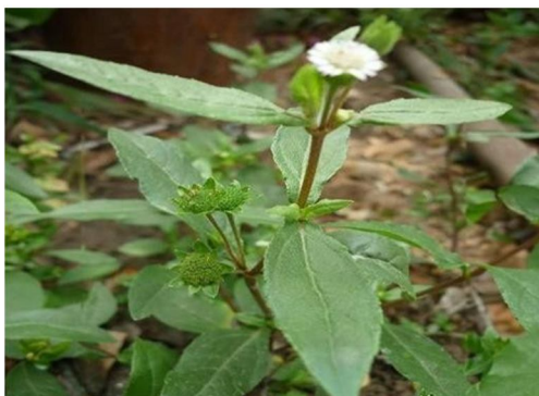
Fig. 1- Bringraj plant