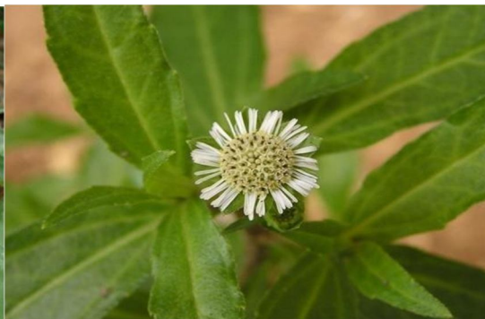
Fig. 2-Bringraj flower