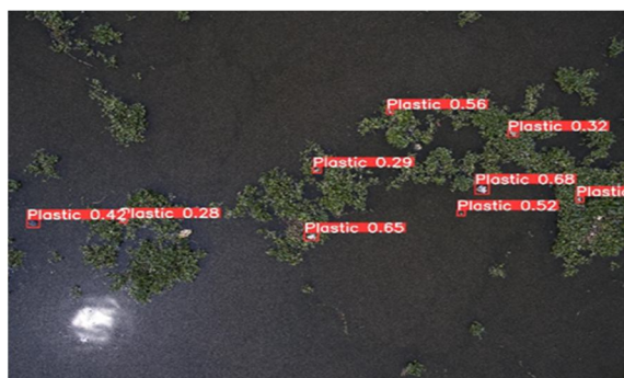
Figure 3. Output image of plastic prediction