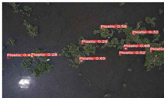
Figure 3. Output image of plastic prediction