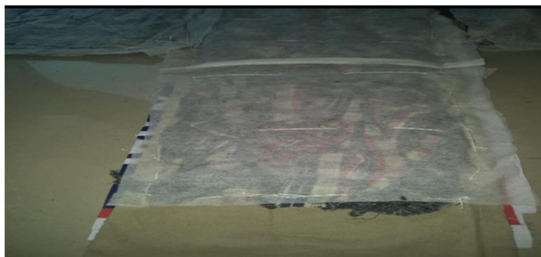
Fig 4. Efficient curing pad for curing to concrete