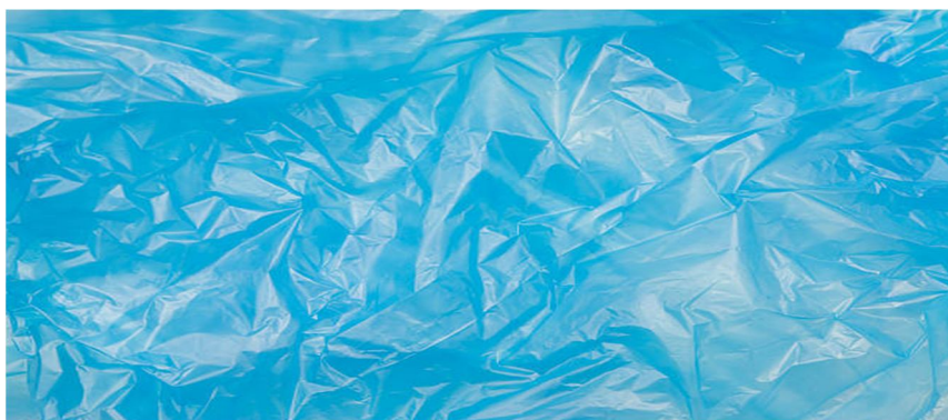
Fig.3. Plastic used in curing pad to prevent water from evaporation

The outermost layer is the PLASTIC layer. Plastic layer is provided in order to control the loss of water from the second layer due to evaporation. This layer of Curing pad also helps to increase the service life of curing pad to make method effectively.