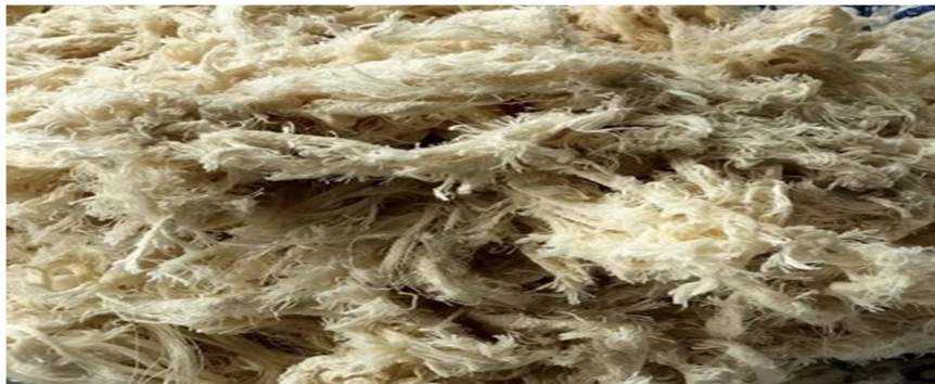
Fig 2. Textile Industry waste used in curing pad

This layer consists of material which is TEXTILE INDUSTRY WASTE. The material used in this layer having good water absorption properly to resist water and percolate for curing.