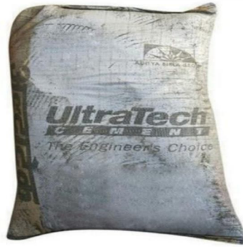
Fig.1 UltraTech cement of OPC 53 Grade