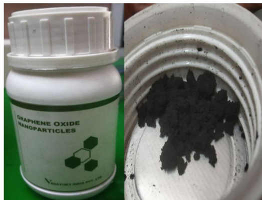
Fig.3 Graphene oxide (GO) (brand: vedayukt india private limited)

Graphene oxide (GO) is an oxidized form of graphene. It is an atomic layer produced by the oxidation of graphite and is inexpensive and readily available. Graphene oxide is easy to process because it can disperse in water and other solvents. The graphene oxide used in this study is shown in Figure 3.