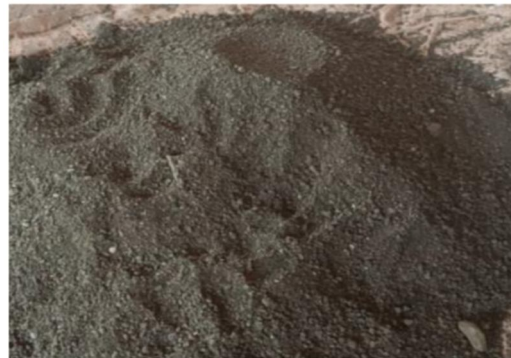
Fig.2 Fresh Local Sand

Use fresh local sand without organic matter as per IS 456-2002. The particles were passed through an IS 4.75 mm sieve. These are used to fill the air spaces in the concrete mix and the quality mix used in the study is shown in Figure 2 below.