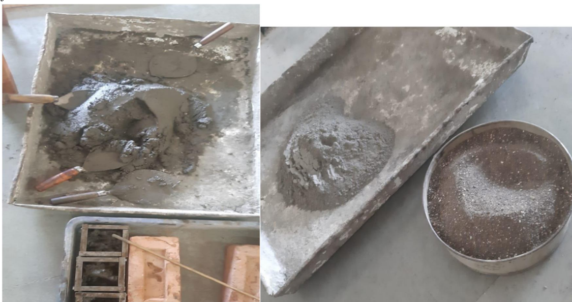
Fig.4 Mixing of Mortar

In this study, the GO variable was used to create the model. These composites were divided into 0% w/w GO cement, 0.03% w/w GO cement, 0.05% w/w GO cement and 0.07% w/w GO cement. Measure the amount of material needed depending on the particular design and mix them to form the mortar.