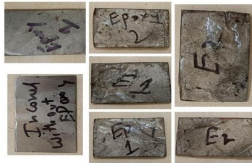
Fig:1. Inconel Sample piece

Each sample consists of 2mm thickness, 30mm height and 45mm length Total 11 samples, out of 1 sample without coating and 5 are Epoxy 1 coating with 1mm, 2mm, 3mm thickness and other 5 are Epoxy 2 coating with 1mm, 2mm, 3mm thickness.