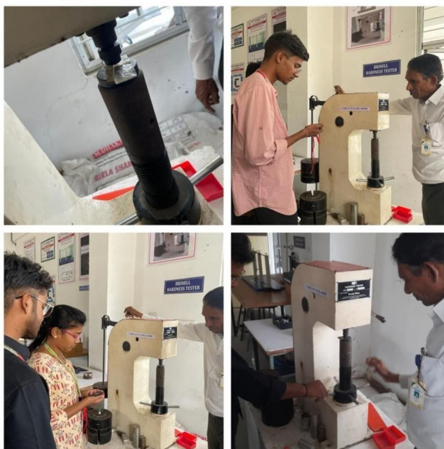
Fig 4. Brinell hardness testing

Brinell hardness is determined by forcing a hardened steel or carbide ball of known diameter under a known load into a surface and measuring the diameter of the indentation with a microscope. We tested samples of different loading conditions.