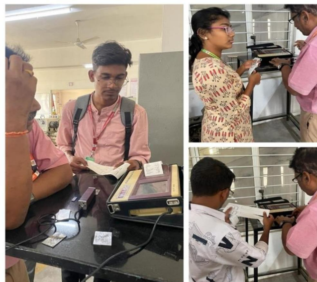
Fig 3. Experimental Setup talysurf

Surface Roughness Testing using Talysurf: The roughness values Ra and Rz are measured using a profilometer gauge (Talysurf) in this experiment. With the use of a moving probe, a surface profilometer gauge is used to measure the roughness parameters with great precision.