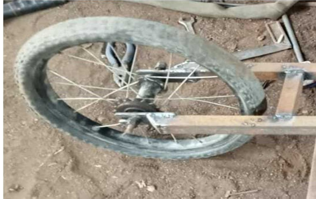
Fig 4: Wheel