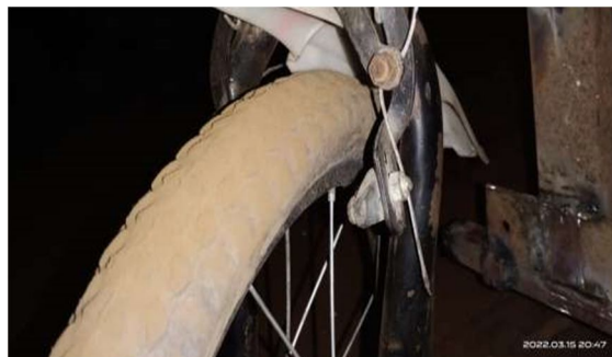
Fig. 5: Brakes

We are using shoe brakes in e scooter, its also known as bicycle brake pad or brake block Rubber asbestos. They rub against the wheel or disc to slow down or stop the e scooter. Brake shoes moulded power brake type made from high quality rubber & insulated steel plate. Brake pads can be made of leather, rubber or cork and are often mounted in metal "shoes". Rim brakes are typically actuated by a lever mounted on the handlebar.