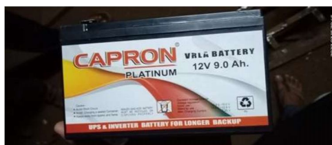
Fig. 2 :-Battery