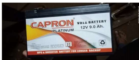
Fig. 2 :-Battery