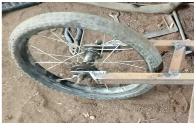
Fig 4: Wheel