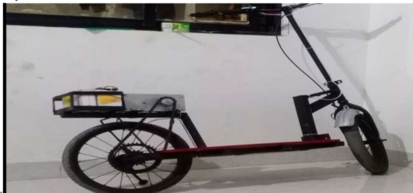
Fig. 1: Electric Scoot.

The companies like Segway & MI have launched their electrical models since last few years. Their concept was very authentic and reliable for using in campus especially for the employees of organization. But, their price was very hefty and it caused much capital Mechanical Projects: Learnmech.com14 to invest for the large scale amount and that was not affordable by the buyers and dealers. And thus it became major problem and drawback for the companies that they couldn't even reach the break-even point for their production and eventually they were in loss.