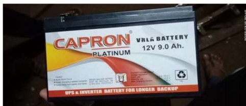
Fig. 2 :-Battery