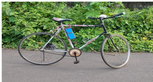
Fig 4. Electric Bicycle

We found that a top speed of around 15 kmph was easily attained by it. The range of the e-bicycle was found to be around 25-30 km. We also tested the prototype in hilly terrains and rough paths to ensure that a comfortable riding experience and desirable e-bicycle performance was achieved. It also has two modes of drive, electric and manual by pedalling, hence one can ride it normally to maintain their health or one can ride it in electric mode for an effort free ride. E-bicycles are getting popular due to their non dependence on fossil fuels and are eco-friendly.