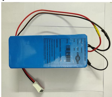
Fig 2. Li-ion Battery

When you plug a lithium-ion battery into a device or piece of equipment, the positively- charged ions move from the anode to the cathode. As a result, the cathode becomes more positively charged than the anode. This, in turn, attracts negatively-charged electrons to the cathode. A separator in the cell includes electrolytes that form a catalyst. This promotes ion movement between the electrodes. The movement of ions through the electrolyte solution is what causes the electrons to move through the device the battery is plugged into. Lithium-ion batteries are rechargeable. When recharging, the lithium ions go through the same process, but in the opposite direction. This restores the battery for additional use.