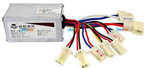
Fig 3. Watt Controller