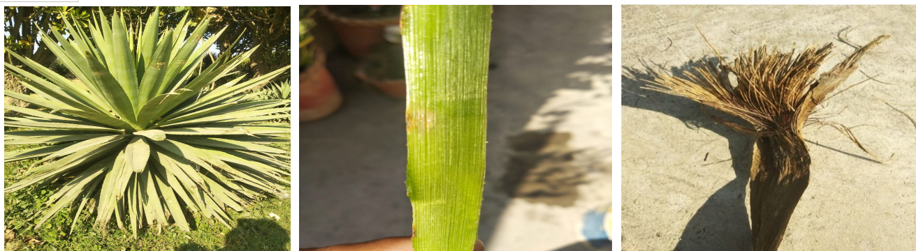
Figure-2 Sisal plant and its Fiber