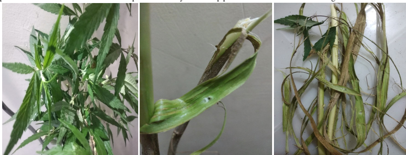
Figure- 4: Hemp and its fiber