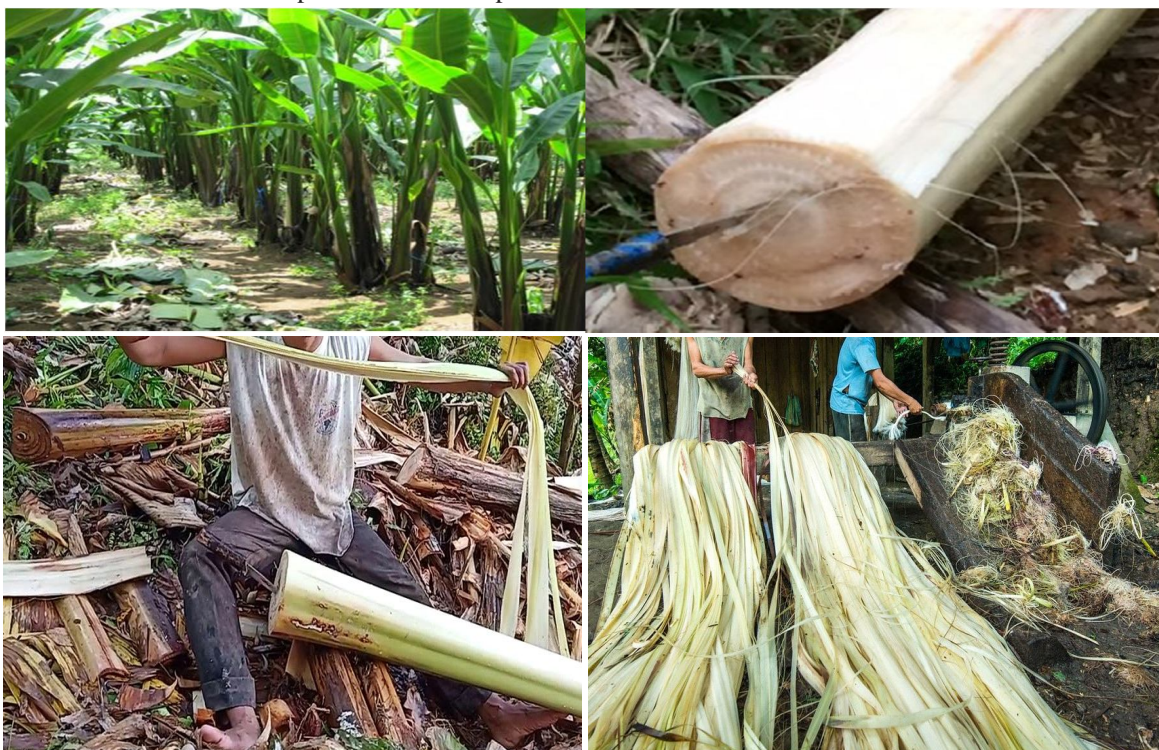
Figure-3: Abaca plant and its fiber