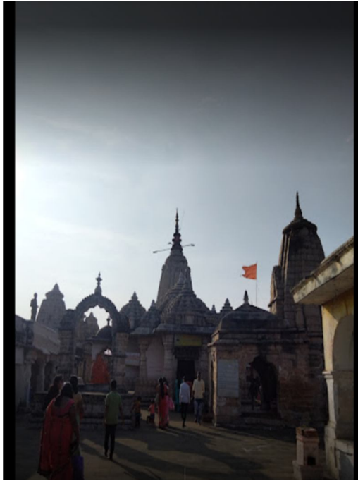
Rama bai bodh vihar ( http://rama bai bodh vihar .ramtek )