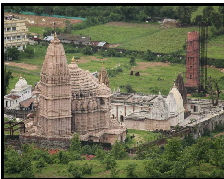
Jain temple view ( http://jain.mandir.ramtek )