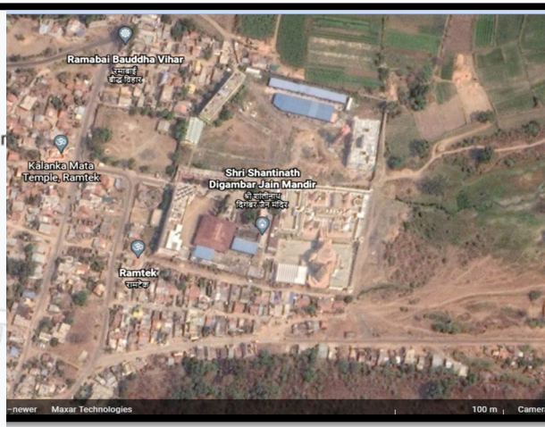
Satellite view of jain temple