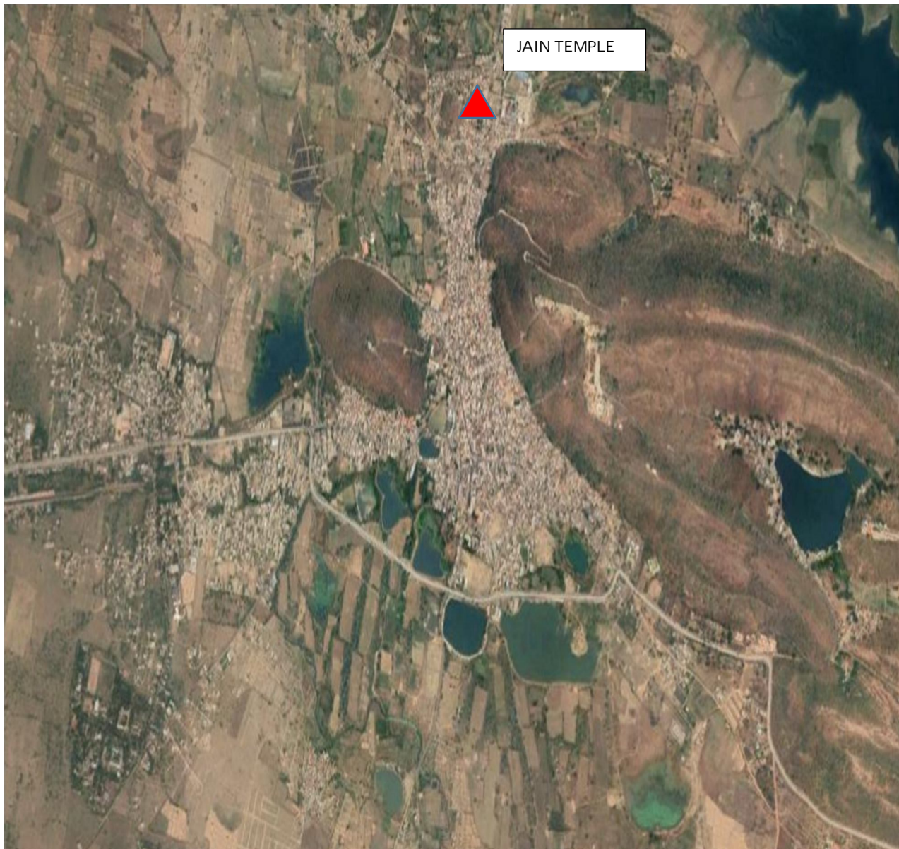
Satellite view of ramtek ( https:// maps.app.goo.gl )