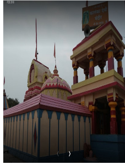
kalank mata mandir ( http:// kalank mata mandir .ramtek )