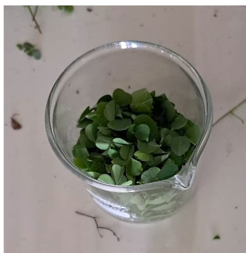
Rhynchosia Minima Plant & Their Leaves