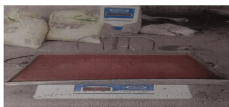
Figure 2: Material test

Red mud is one of the major waste material during production of alumina from bauxite by the Bayer's process. It is an insoluble product generated after bauxite digestion with sodium hydroxide at elevated temperature and pressure is known as red mud or „bauxite residue". It comprises of oxides of iron, titanium, aluminium and silica along with some other minor constituents. Based on economics as well as environmental related issues, enormous efforts have been directed worldwide towards red mud management issues i.e. of utilization, storage and disposal. Different avenues of red mud utilization are more or less known but none of them have SO tar proved tO be economically viable or commercially feasible. The red mud is classified as dangerous, according to NBR 10004/2004, and world while generation reached over 117 million tons/year. In present work experiments have been conducted under laboratory condition to assess the mechanical properties of the aluminium, red mud and Silicon carbide composite. This has been possible by fabricating the samples through stir casting technique. To enhance the mechanical properties, the Samples were also subjected to heat treatment.