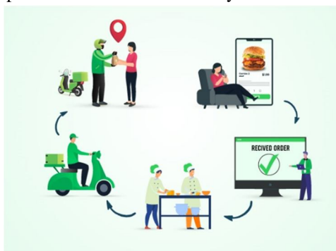
FIG 1: Cycle of food ordering online