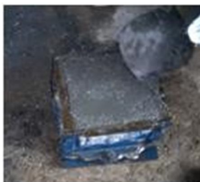
Figure 5: Clearing of top edges

After filling the molds completely with the mortar, a needle vibrator was used to remove air voids from the mortar. It is to be kept in mind that needle vibrator is used just for few seconds to avoid segregation and floating of EPS balls to surface. After the compaction has been completed, the excess mortar was removed from the moulds with the help of trowel and the surface was levelled. After a setting time of 24 h, concrete samples were demoulded and were taken for curing.