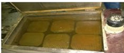
Figure 6: Accelerated Curing of Cubes in Boiler at 60°C

Curing was done by covering the blocks with a damp cloth for period of 3 days, then the moulds were taken to KJ Somaiya Polytechnic College, Vidyavihar, Mumbai for Accelerated Curing.