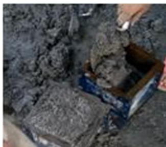
Figure 3: Filling mortar in moulds

The steel moulds of 150x150x150 mm were oiled properly before filling mortar. The mortar was filled into the moulds in three layers with hand compaction after adding each successive layer