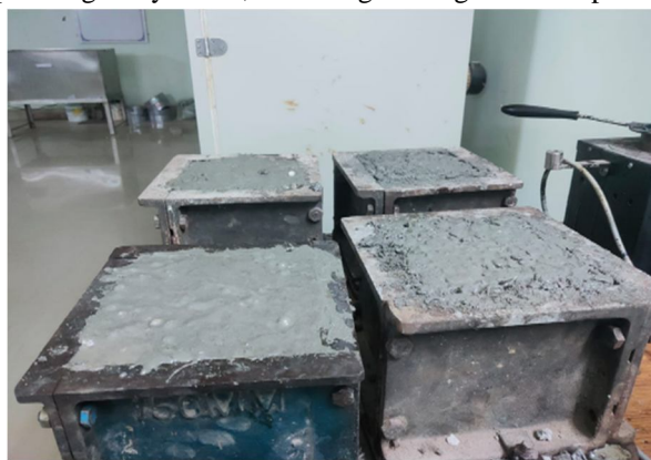
Figure 1: EPS Concrete

Lightweight concretes (LWCs) can be used in various construction fields. It can be used for repairing wooden floors of old buildings, carrying walls of low thermal conduction, bridge decks, floating quay, etc. For the first applications, the lightest possible material is used, i.e., usually it has a specific gravity of 0.5, the strength being of less importance.