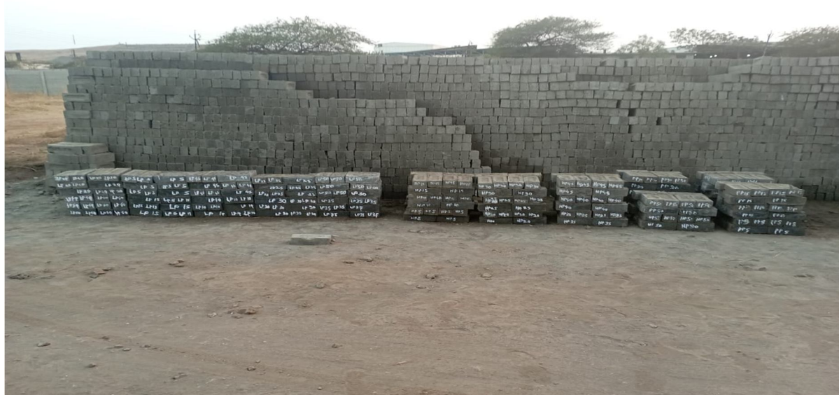
Bricks With Naming