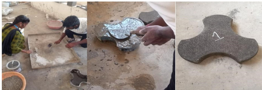
Fig.6 Mixing of Materials