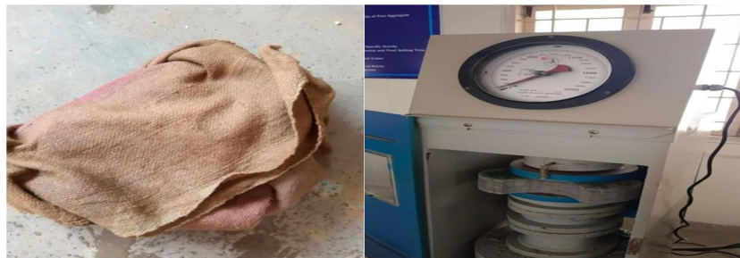
Fig.9 Water Curing

The compressive strength test of paver block size is 275mm x 220mm x 130mm employed. The test was conducted as per the code of IS 15658-2006. The tests were carried out at a uniform stress after the specimen has been centered in the testing machine. The Compressive strength of 9 N/mm 2 is achieved in 14 days. Then after we proceed 28 days of the compressive strength, we get 14.7N/mm 2 . 5. As per the required is above 10, so it is satisfied.