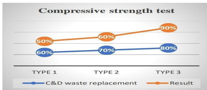
Fig.11 Graph Result