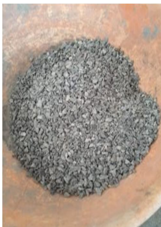
Fig.1 Coarse Aggregate

Air entraining agents: These are used to create air bubbles within the concrete mixture which can improve its freeze-thaw resistance and durability.