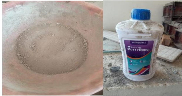
Fig.4 C&D Waste