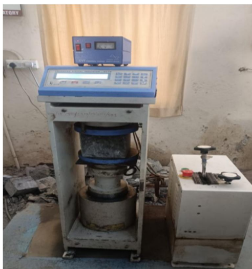
Fig 2 - Testing of compression strength cube.