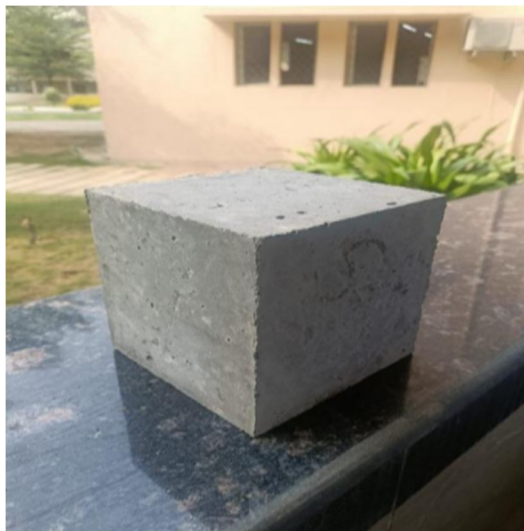
Fig 1 - Cube (150 X 150 X 150)