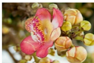
Figure 8 shorea robusta flower