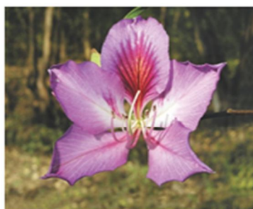
Figure 11 bauhinia variegata flower