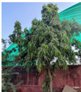
Figure 4 polyalthia longifolia tree