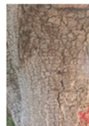
Figure12bauhinia variegata bark