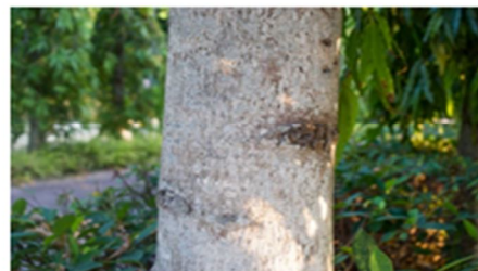
Figure 6 polyalthia longifolia bark