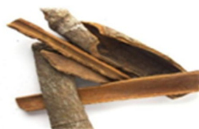
Figure 3:-saraca asoca bark