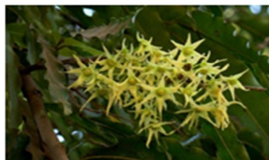
Figure 5 polyalthia longifolia flower