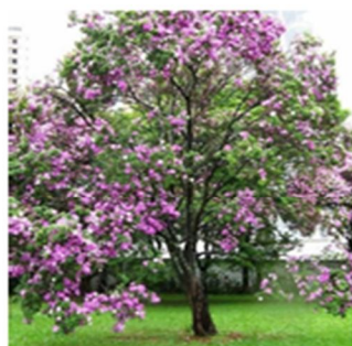
Figure10bauhinia variegata tree