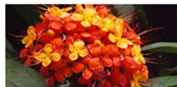
Figure 2:saraca asoca flower