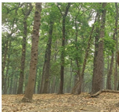
Figure 7 shorea robusta tree