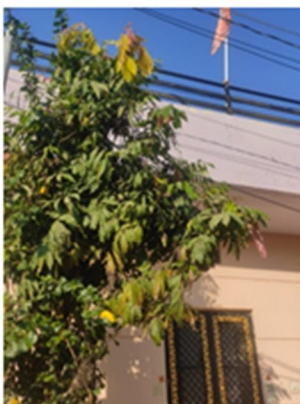
Figure 1 saraca asoca tree

Saraca asoca-Saraca indica, an evergreen, grows to a height of 7 to 10 meters. The leaves are paripinnate, intrapetiolar, 15-20 cm long, oblong to lanceolate, and fully joined. The bark of this species is warty and irregularly dark brown or nearly black due to rounded or projecting lenticels. Fracture splinting results in a continuous, thin white coating. The apetalous, corymbose, golden orange, and deciduous flowers with petaloid calyxes. They are compressed, elliptical, elongated, and seed shaped. 12