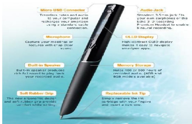
Figure 3: Display Scrolls by Tilting Screen

Moreover, the Smart Quill could be tilted in the hand to scroll through the pages of the display and turn off if there was no hand movement.