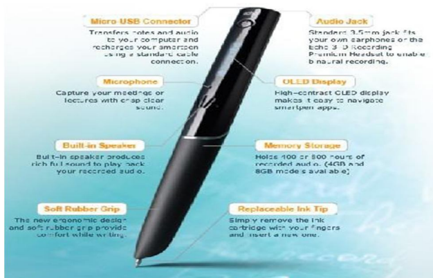
Figure 3: Display Scrolls by Tilting Screen

Moreover, the Smart Quill could be tilted in the hand to scroll through the pages of the display and turn off if there was no hand movement.