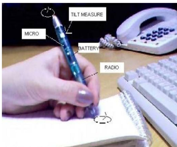
Figure 1: Smart Quill

The information that is stored in the pen can also be read on a tiny three-line screen; Using the pen, users can slightly tilt the screen to scroll down. The user teaches the pen to recognize a particular style of writing. The pen can recognize messy writing as long as it is consistent. The pen's hard drive contains the handwritten notes.