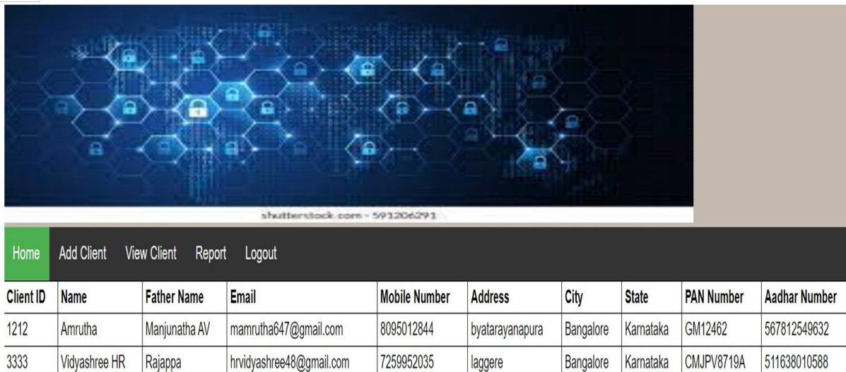
Figure: Final result