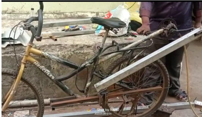
Figure1. Fabrication phase-I started

This describes about the fabrication of cross trainer with bicycle: