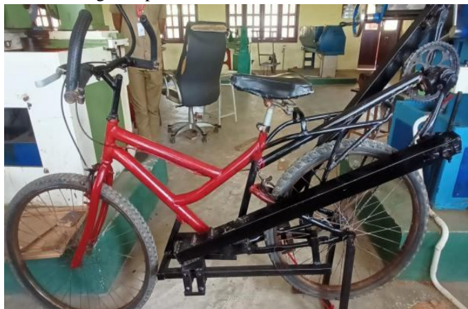
Figure3. Final look of elliptical move after completion of fabrication phase-II

The above figure shows the connection of the dynamo meter with the cycle which is mechanical energy to the electrical energy that energy we use in general applications like to charge the phones etc.