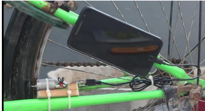
Figure2. Connection of the dynamo meter

The above figure shows the commencement of fabrication phase-I which includes bending of pipes, arc welding of basic joints while taking care of distortion caused during welding.