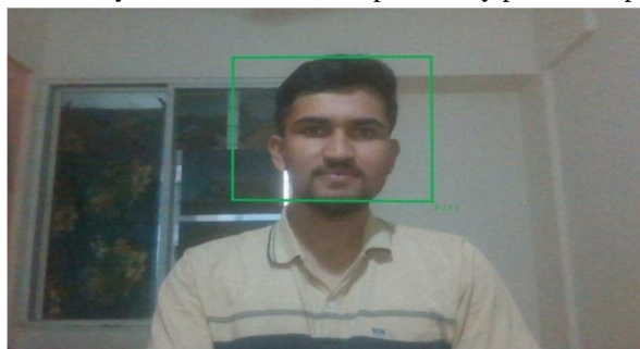
Fig.3. FR of a Human Face

For numerous researchers and applications, face detection is essential and intriguing, such is face recognition in video surveillance, object tracking, template matching, and expression analysis. It consists of three phases, each of which serves an important purpose. Examples include preprocessing, feature extraction, and data categorization. To begin, preprocessing is the removal of certain areas from pictures or real time web cams, which are subsequently utilised as candidate images for faces or non-face items. Second, feature extraction entails extracting the necessary characteristics from previously processed pictures.