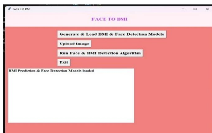
Fig: UI of landing page