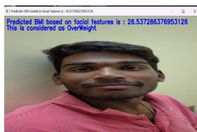
Fig: Output on UI screen

Your BMI predicted as : 23.480632019042968 This is considered as Healthy Weight