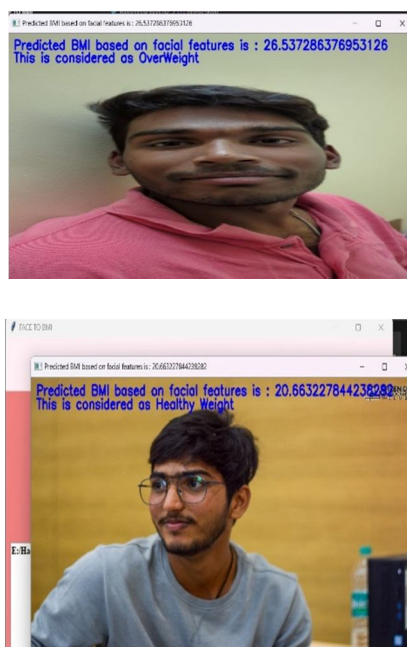
Fig: Output on UI screen

The BMI of the above images are 26.5 and 20.6 respectively classifying the two pictures as overweight and healthy weight.