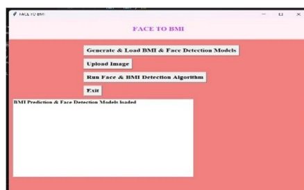
Fig: UI of landing page