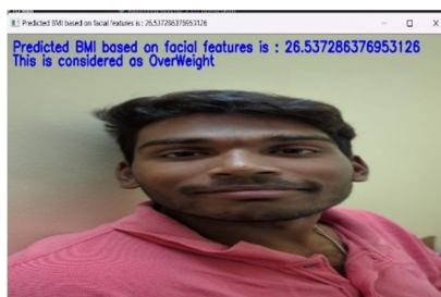
Fig: Output on UI screen

Your BMI predicted as : 23.480632019042968 This is considered as Healthy Weight