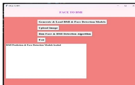
Fig: UI of landing page