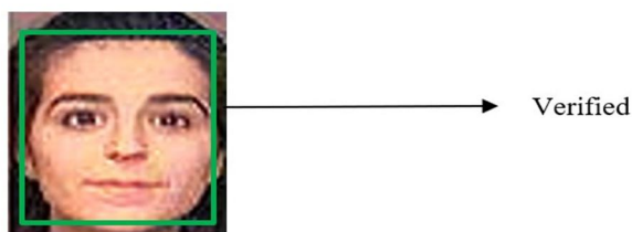
Figure 3: Successful match