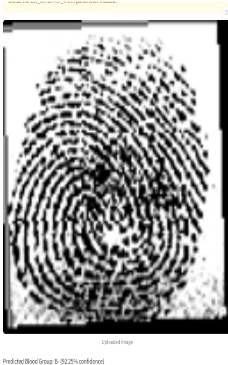
Figure 5.1 Output images

The blood group identification system's results show promise, with excellent accuracy in predicting blood types utilizing fingerprint image processing and the Multilayer Perceptron (MLP) algorithm. The system's performance was confirmed through thorough testing, confirming its dependability and efficacy in real-world circumstances. Furthermore, the system's non-invasive nature greatly enhances patient comfort and access to blood type information, making it an invaluable tool for healthcare practitioners. The system's resilience was further demonstrated by its capacity to manage fluctuations in fingerprint quality and environmental circumstances. Overall, the findings show that this novel strategy has the potential to transform blood typing processes and contribute to advances in biometric technology and healthcare delivery.