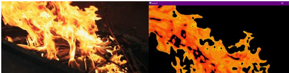
(a) (b) Figure 1:Result of background removal and frames

All video datasets will be extracted into picture frames during this phase. The number of frames extracted every second will be in the range of 24 to 30. Following this step, each picture will be analyzed to provide a feature based on colour segmentation and frame movement