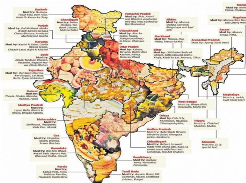
Fig. 1 Indian Cuisine Diversification