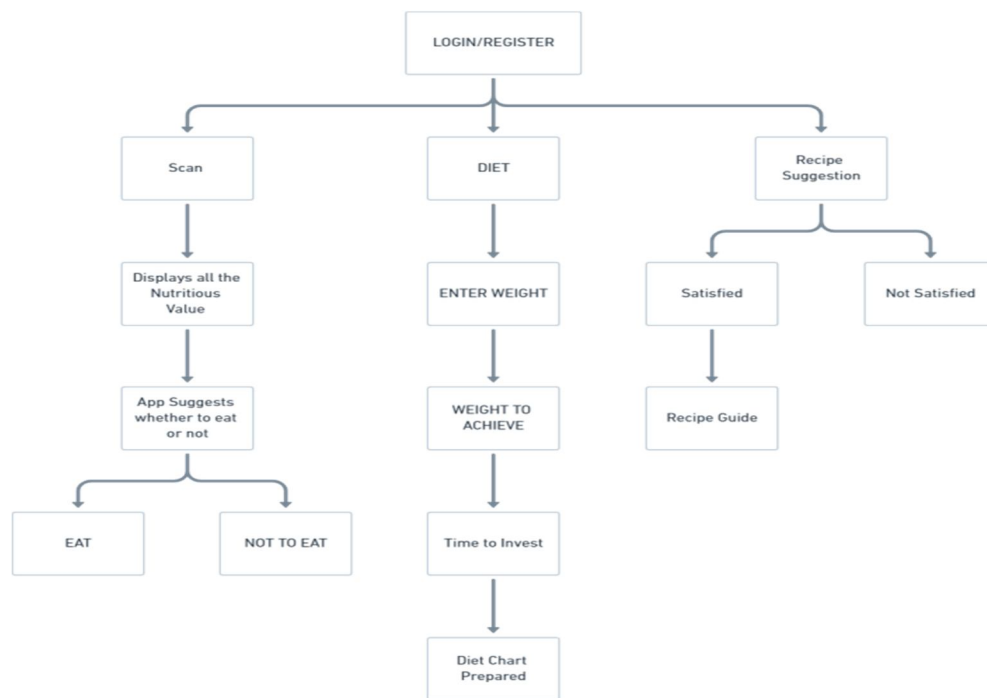
Figure 2 : Flowchart of Foodwiser