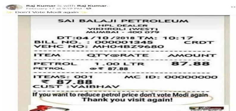
Figure 1: An example of a form document for extracting information

To Model, the information in the structural form present in [1] Nomen Islam, Zeeshan Islam, and Nazia Noor (2016) introduced the OCR System that is Optical Character Recognition to solve the problem of unstructured text recognition. OCR is used to solve complex problems but becomes difficult because of different languages, fonts, and styles. There is a Review on OCR [2] Jay Dilipbhai Thanki, Priyanka Dineshbhai Davdaand Dr. Priya Swaminarayan(2021) in which all information on OCR i.e uses, application, advantages and how it will work is given. With the help of all this information, we are going to form a system of Form-Based Document Model.