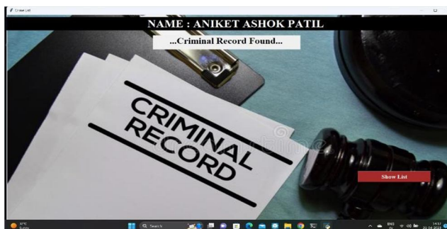
Figure 4.6 : Criminal Detection

And lastly by clicking on Criminal analysis button will open a page which display name of the person and whether the person has criminal record or not.