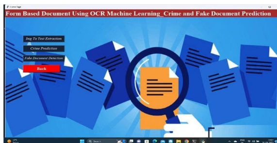
Figure 4.1 : Home Page

Below image shows the home page where there are three options: Img to text extraction , Criminal analysis , fake document detection.