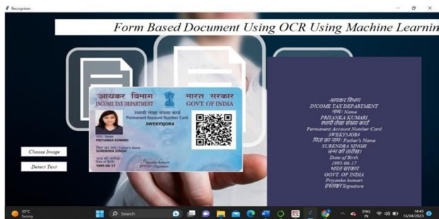
Figure 4.4 : Extracted Text

To extract the relevant information from that selected image click on detect text option .