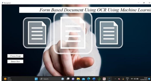
Figure 4.2 : Text Extraction Page

By clicking on first option i.e. img to text extraction will display the page as shown in below image.