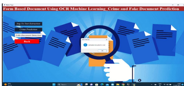
Figure 4.5 : Authentication

By clicking on Fake document detection button on home page, Dialogue box will appear displaying whether the document is fake or real.