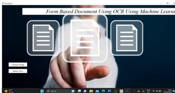
Figure 4.2 : Text Extraction Page

By clicking on first option i.e. img to text extraction will display the page as shown in below image.