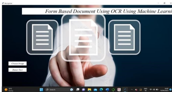
Figure 4.2 : Text Extraction Page

By clicking on first option i.e. img to text extraction will display the page as shown in below image.