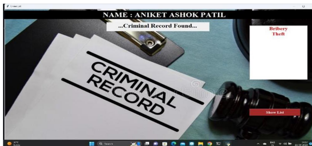
Figure 4.7 : Criminal record Result

If person has some criminal record then there is a option at the bottom of the page to show the list of crime.