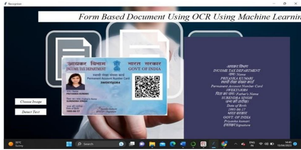
Figure 4.4 : Extracted Text

To extract the relevant information from that selected image click on detect text option .