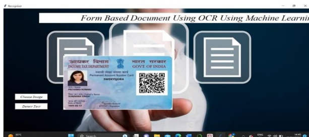
Figure 4.3 : Input to Text Extraction

By clicking on choose image button , we can choose image from directory and that image is visible on the screen as shown in below image.