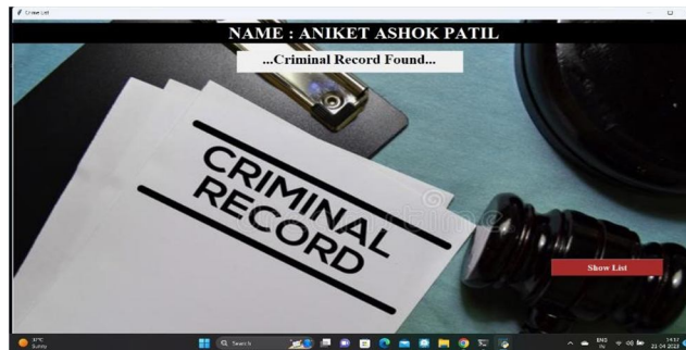
Figure 4.6 : Criminal Detection

And lastly by clicking on Criminal analysis button will open a page which display name of the person and whether the person has criminal record or not.