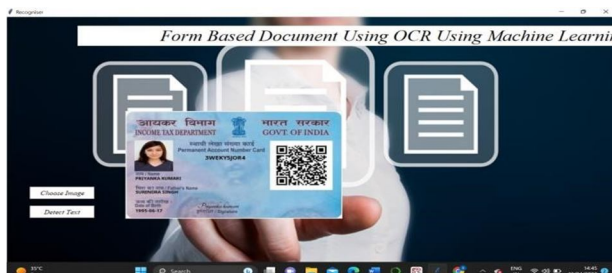
Figure 4.3 : Input to Text Extraction

By clicking on choose image button , we can choose image from directory and that image is visible on the screen as shown in below image.