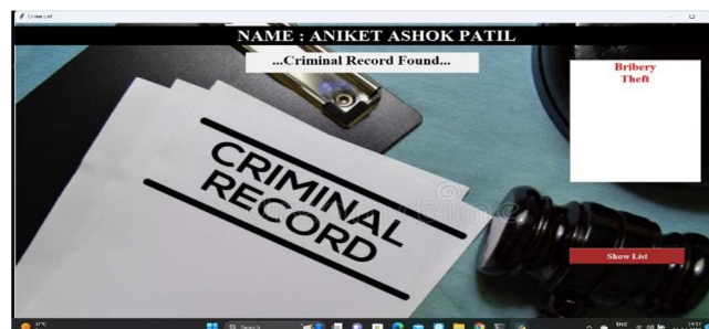
Figure 4.7 : Criminal record Result

If person has some criminal record then there is a option at the bottom of the page to show the list of crime.