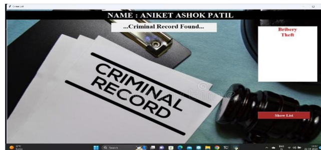
Figure 4.7 : Criminal record Result

If person has some criminal record then there is a option at the bottom of the page to show the list of crime.