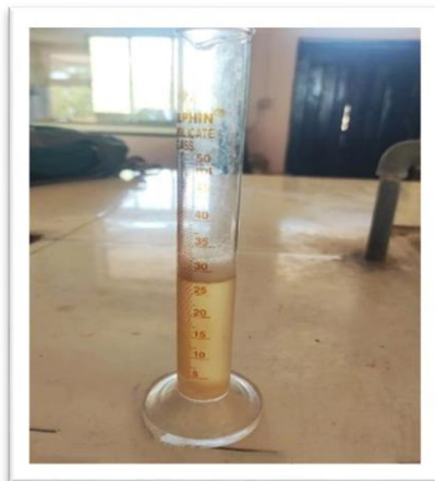
Fig no.7. Foamability

In a graduated measuring cylinder, a small quantity of scrub was once agitated with water to quantify the foam.[42]