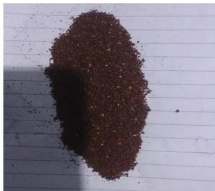
Fig no.3.Beal fruit powder

Aegle marmelos fruit is grated and dried in sunlight for seven days. Once dried, it is ground into a powder after all the water has evaporated.