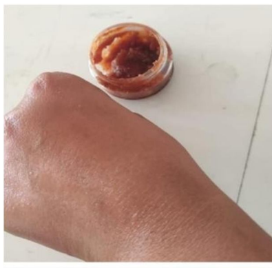
Fig no.6. Washability

This take a look at was carried out immediately on the skin. After applying the education and rinsing the pores and skin with regular water, the skin was found to be clear and clean.