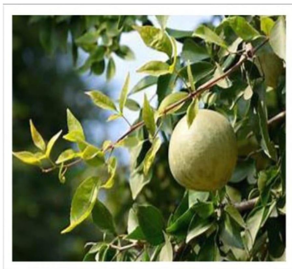
Fig no. 2: Beal Fruit [33]