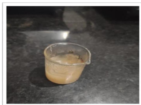
Fig no.4.Preparation of gel

Methyl paraben was dissolved in rose water, then tragacanth gum was added and stirred until it formed a gel. Sodium lauryl sulPhate was dissolved in rose water separately and added to the gel. Propylene glycol was then added. Triethanolamine was added drop by drop to neutralize Ph. Finally, the active ingredient was added and stirred into the prepared gel.