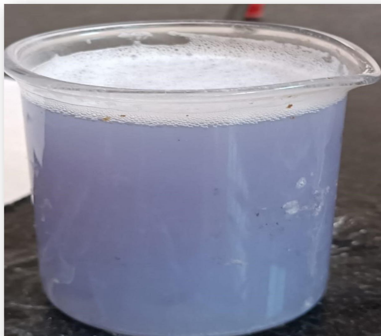
Fig.03. Formulation of Phenyl