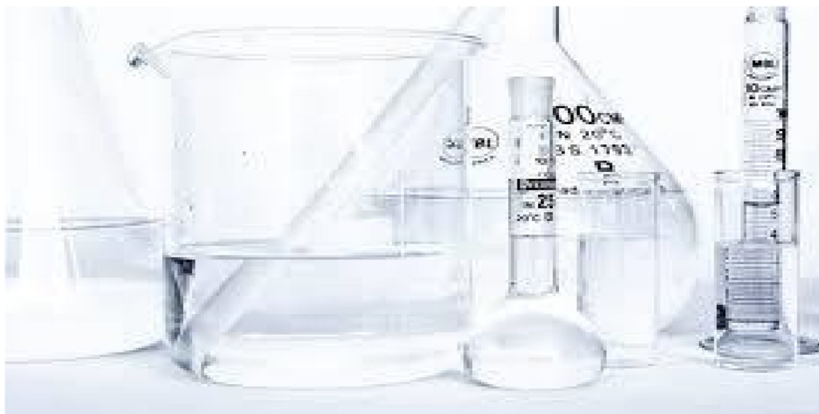
Fig .2. Instrument