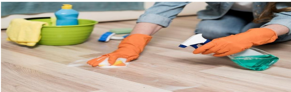
Fig.04 . Floor cleaning

The material, when applied either neat or diluted with water by means of a clean lint-free cloth or a cotton mop, will clean as described in the Indian Standard