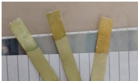
Fig. No. 3 pH detection

By applying a pH strip to freshly made tablet and using a digital pH meter to dissolve 1 gram in 10 ml of water, the pH of the manufactured tablet was measured [35] .