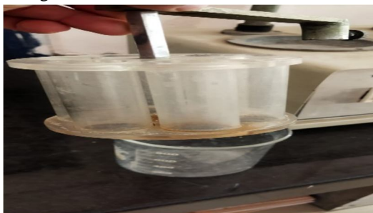
Fig. No. 6 Disintegration