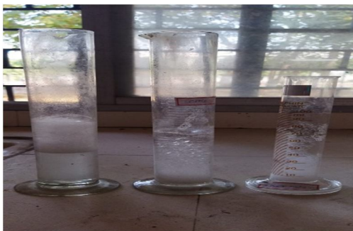
Fig. No. 5 Foam Retention

A graduated measuring cylinder with a capacity of 100 ml was filled with 25 ml of the 1% soap solution. Hands were placed over the cylinder and it was shaken ten times. For four minutes, the volume of foam was measured at one-minute intervals. [36]