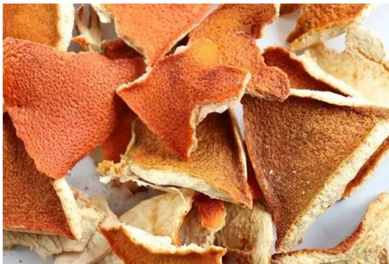
Fig. No. 1 Orange peels