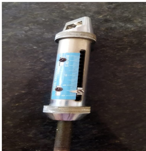
Fig. No. 7 Hardness Tester