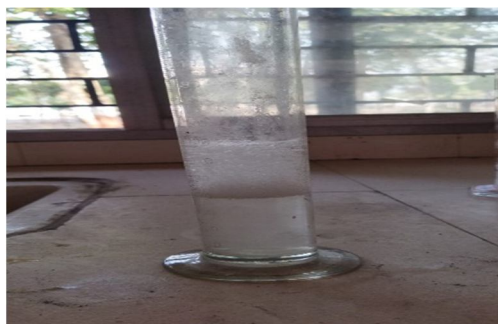
Fig. No. 4 Foam Height

A sample of soap weighing 0.5 grammes was dissolved in 25 cc of distilled water. Then, pour it into a 100 ml measuring cylinder after adding water to make the volume 50 ml. 25 strokes were given and held until the aqueous volume reached 50 ml and the foam height was measured above the aqueous volume.