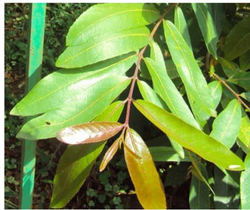
Fig 2 - Terminalia arjuna