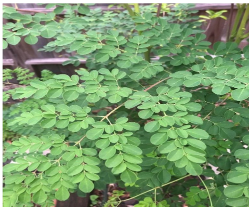
Fig 1- Moringa oleifera

Moringa oleifera Lamarck ( Moringa ) is the developed species of the class Moringa of the family Moringaceae [24]. Is a perennial tropical deciduous tree with tall financial and pharmaceutical value? As an eatable plant, M. oleifera Lam. Is wealthy in supplements, such as proteins, amino acids, mineral components and vitamins. Other than, it too contains a critical number of bioactive phytochemicals, such as polysaccharide.