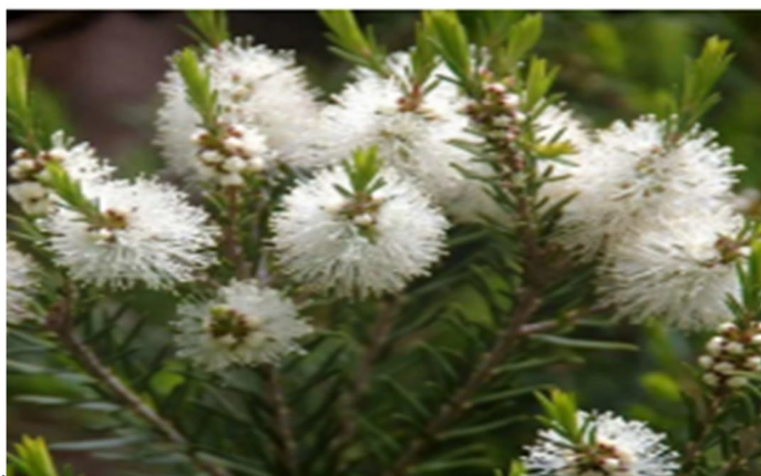
Fig-2- Melaleuca alternifolia

Terpinen-4-ol, an alcoholic terpene with a clean, musty aroma, is its main component. The antiviral action is due to alpha-sabine, which also has antibacterial and antifungal qualities. Terpinen-4-ol has an immune-stimulating impact, while cineole is said to have antimicrobial qualities. The tea tree itself possesses antiviral, antibacterial, anti-inflammatory, immune-stimulating, and insecticidal properties. Aromatherapy uses a mixture of blue gum, lemon, eucalyptus, clary sage, lavender, ginger, rosemary, and Scotch pine to treat a number of ailments. Burns, blisters, herpes, abscesses, acne, cold sores, dandruff, and bugs. It must also be certified to treat a range of respiratory disorders, such as TB, bronchitis, asthma, coughing, and whooping cough. In addition to treating chickenpox, fever, flu, and colds, it is also used to treat pruritus, vaginitis, and cystitis in females. Well-defined studies on the effects of the tea tree, Melaleuca alternifolia , on herpes have been carried out through clinical trial efforts, and the plant has demonstrated promising outcomes.