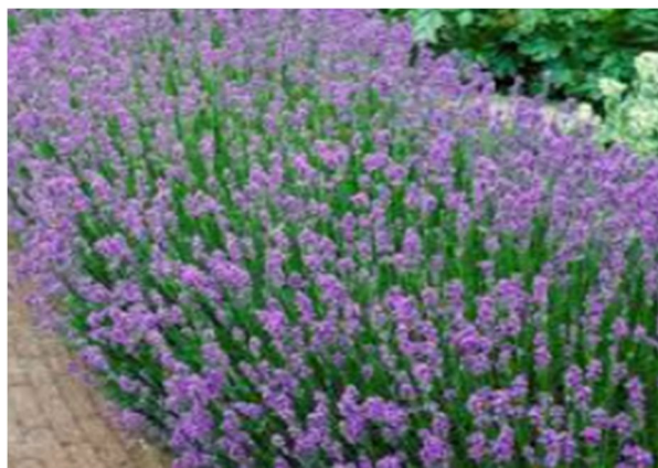
Fig.1 - Lavandula officinalis