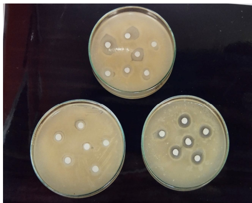
Fig. 2 Zone of Inhibition on soap samples