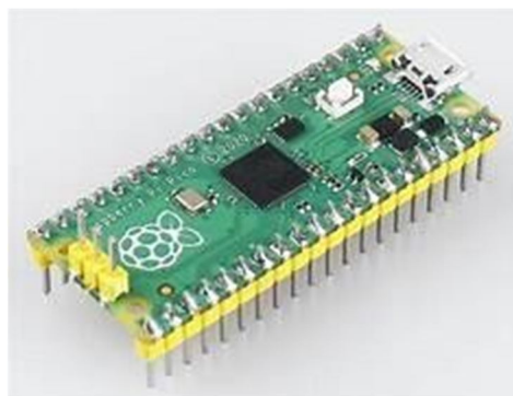
Fig.3. Raspberry pi pico

Raspberry pi pico The Raspberry Pi Pico is a microcontroller board based on the Raspberry PiRP2040 microcontroller chip. Raspberry Pi Pico is designed as a low cost yet flexible RP2040 development platform.