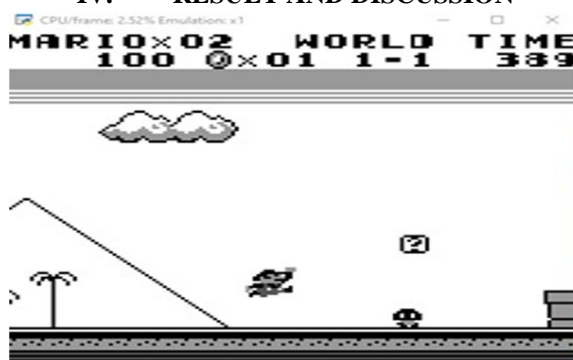
Fig.1. This is the Py Boy Emulator. Running the super mario game environment .