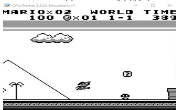
Fig.1. This is the Py Boy Emulator. Running the super mario game environment .