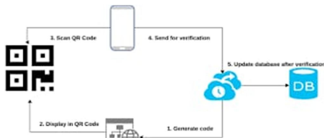
Fig:1 QR code

The QR code, commonly referred to as a two-dimensional barcodes, was developed in 1994 by the Japanese automotive Wave. "Rapid response code" is what QR stands for. A barcodes is an optical identification that computers can read and that carries information about the product to which it is attached. The details for a track, location, or identification that points users to a website is typically included in QR codes. A QR code uses four specified encoding modes to efficiently store data: numeric, alphanumeric, binary, and extensions are optional.