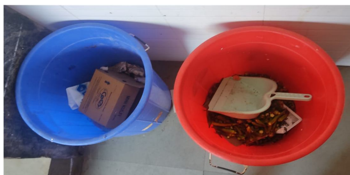
Fig.6.2 Canteen waste