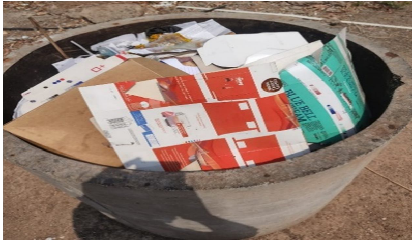
Fig. 6.3 Main Building Waste