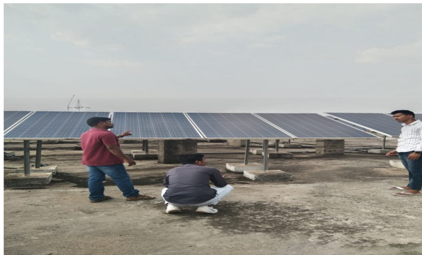
Fig. 6.4 solar panel