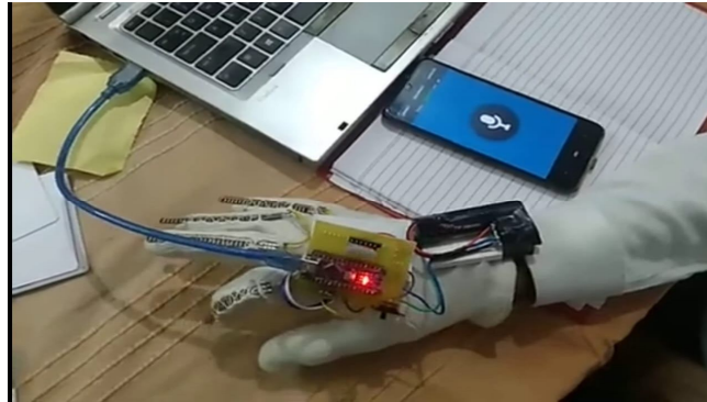
Fig 2. Actual Hand Gesture Vocaliser

Additionally, the speech synthesis module demonstrated notable success in converting the recognized gestures into clear and audible speech. Through user feedback and qualitative evaluations, the system's ability to articulate words and phrases accurately was found to be satisfactory. Users, including those with speech impairments, reported that the system effectively conveyed intended messages, showcasing its potential as an intuitive and reliable communication tool.