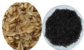
Fig 1. Rice husk Before and After Filtration

Rice husk, collected from a local rice mill in Choornikara panchayath, is used for the work. Collected Rice husk is carbonized in a muffle furnace at 200°C for 45 minutes (Fig 1).