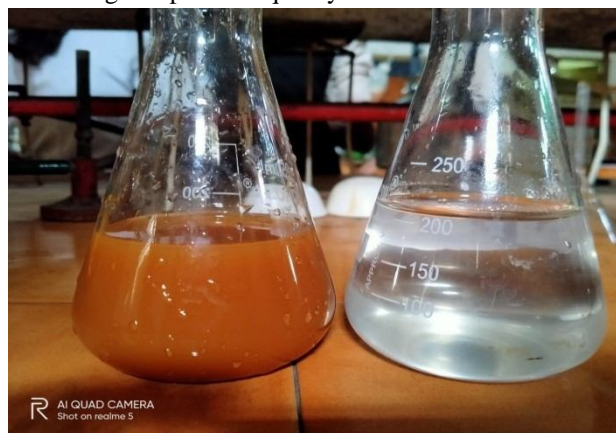
Fig 3 Water Quality Before and After Filtration

Rice husk adsorbed calcium and Magnesium ions into its surface when untreated water is passed through it, and this causes a reduction in the hardness of the sample water [12]. The work was also successful in the removal of heavy metal Cu. It is a metal in the environment as a mineral in rocks and soils. According to IS-10500-2012, the acceptable level of Cu in Water is 0.05 mg/L [13]. The permissible limit of Iron in drinking water is 0.3 mg/L, according to Indian Standard [14]. Filtration through carbonized rice husk caused a remarkable reduction of Iron from 14.53 mg/ L to 0.22 mg/L. Passing through carbonized rice husk, the turbidity of water has reduced from 846 NTU to 7 NTU. Fig 3 depicts the quality of Water before and after Filtration.