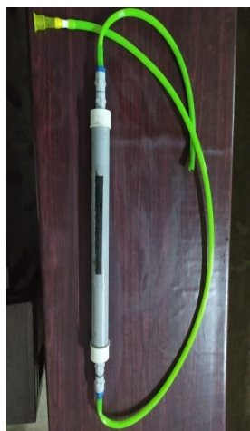
Fig 2a Filter

In the construction of the filter, a PVC pipe is used. MTA (Male Threaded Adapter) and FTA (Female Threaded Adapter) are connected on both sides. They are plumbing materials used to connect pipes with metals, hoses etc. FTA and MTA are joined with PVC-by-PVC end caps on both sides. In addition to these, hoses are also fitted on both sides. The figure is shown in Fig 2 a & b depict the original and schematic diagram. One hose will allow the passage of untreated Water through it; another one will treat it, and filtered Water can be collected. The PVC pipe is filled with activated carbon, carbonized rice husk and pebbles and constitutes the filtration bed. Rice husk is carbonized at 200°C for 45 minutes. Carbonized rice husk having a large surface area will absorb heavy metals, like calcium, Magnesium, Fe etc., into its surface, and they can be removed. The sample is added to pass through the filtration bed, and filtered Water is collected. The physical parameters of water samples are analyzed before and after Filtration. pH, conductivity, turbidity, TDS, hardness etc., are measured. Cu content is measured by Atomic Absorption Spectroscopy (AAS), and Spectrophotometry determines Fe content. Then compared the quality of Water before and after Filtration and then analyzed the adsorbing capacity of rice husks.