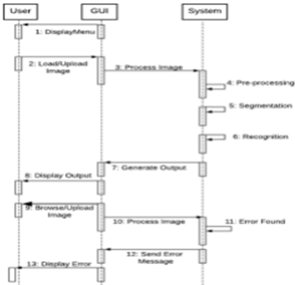
Fig4:- SSystem sequence diagram

Figure 4 shows the sequence diagram of the system model. The figure describes the sequence of steps to be taken while performing. The CNN model works in the following sequence. Users upload a specific image of any digit they want to see. The picture will be processed. When you use a system code the output is generated which shows which digit it was loaded with than in the code, the output indicates an error, and indicates an error message in use.