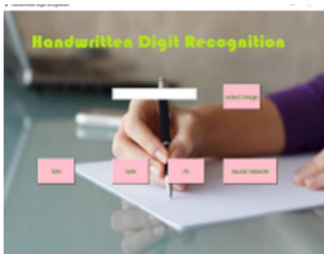
Fig 6:- Front-end design of the sys

The following Figure 6 shows the formation of the front end of the system exit. There are four buttons for the four algorithms as shown in the figure.