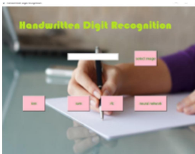
Fig 6:- Front-end design of the sys

The following Figure 6 shows the formation of the front end of the system exit. There are four buttons for the four algorithms as shown in the figure.