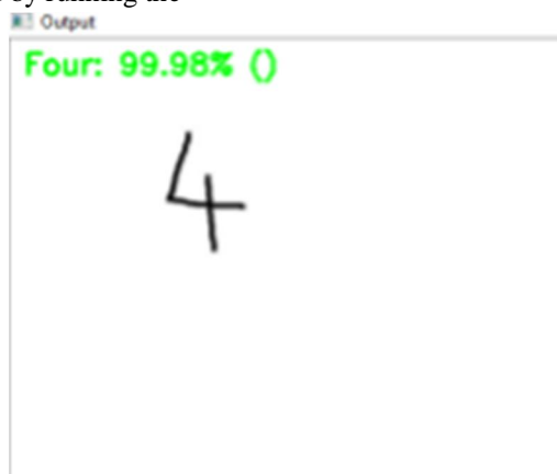
Fig 12:- Output generated by CNN

The Figure 10 shows the output generated by running the