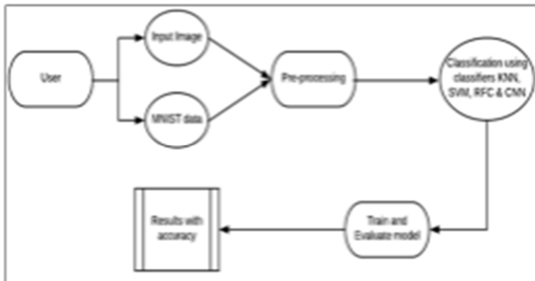
Fig 5:- Data Flow Diagram of the system model V.

The following Figure 5 describes a data flow diagram of the proposed system model. There are two ways to provide input into the system. The user can upload a digital image they want to receive or data from the MNIST database. Input images are pre-processed. Using different dividers the accuracy of known digits is compared and the result is obtained. The results obtained are displayed with accuracy.