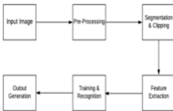
Fig 1:- Architecture of the Proposed System

The purpose of this document is to look at the design possibilities of the proposed system, such as architectural design, block diagram, sequence diagram, data flow diagram and system user interface design to define steps such as pre-processing, output, partition, segmentation and digital recognition.