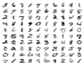
Fig 2:- Sample images taken from MNIST database

The first method is to teach a set of images to be processed to reduce data, by combining it into a binary image. Figure 2 shows a sample of photos taken on the MNIST website.