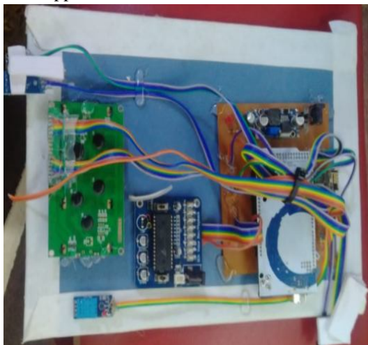
Fig.1 Implementation of the system