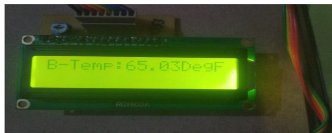
Fig.3: When the temp is displayed