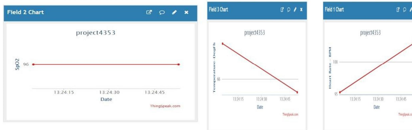
Fig.4 & Fig.5: Graphical representation of the datacollected

The IoT technology is used to monitor the health parameters such as body temperature, blood oxygen, and heart rate. The signals received by the atmega328 microcontroller from the sensors are converted from analog signals to serial signals with the help of ADC located in the Arduino board and further is processed and sent to the Raspberry Pi then updates them into the thing speak cloud and also display on the LCD module as shown in fig.2 and fig.3. The main controlling device of the project is the Raspberry pi zero w processor which is loaded with an intelligent program in python language. The data is also depicted graphically to show if the data or the health parameters are increasing or decreasing as the data is updated in the server every 12 sec in fig.4 and fig.5.