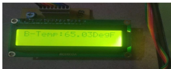
Fig.3: When the temp is displayed