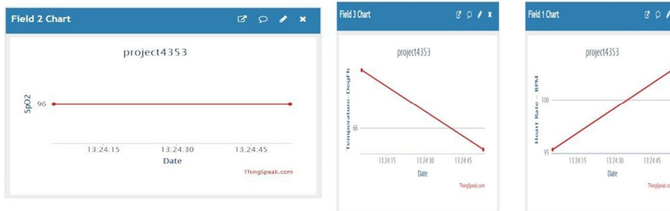
Fig.4 & Fig.5: Graphical representation of the datacollected

The IoT technology is used to monitor the health parameters such as body temperature, blood oxygen, and heart rate. The signals received by the atmega328 microcontroller from the sensors are converted from analog signals to serial signals with the help of ADC located in the Arduino board and further is processed and sent to the Raspberry Pi then updates them into the thing speak cloud and also display on the LCD module as shown in fig.2 and fig.3. The main controlling device of the project is the Raspberry pi zero w processor which is loaded with an intelligent program in python language. The data is also depicted graphically to show if the data or the health parameters are increasing or decreasing as the data is updated in the server every 12 sec in fig.4 and fig.5.