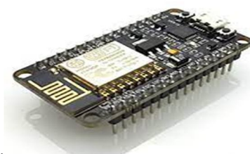
Fig. 1. NODE MCU

We can also connect Node MCU with WiFi network and use it for IOT applications and to connect to Web servers