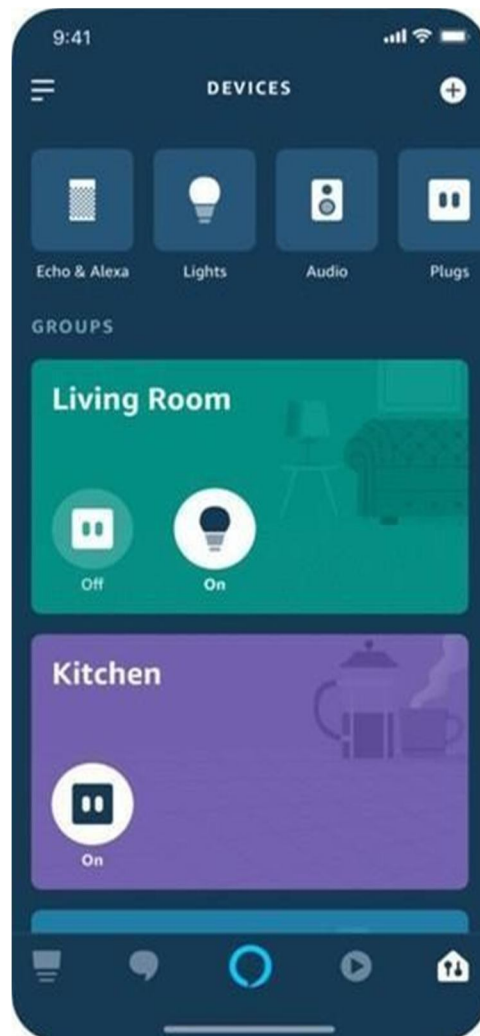
Fig.3 Alexa Home Screen

Amazon Alexa, also known simply as Alexa, is a virtual assistant technology largely based on a Polish speech synthesizer named Ivana, bought by Amazon in 2013. It was first used in the Amazon Echo smart speaker and the Echo Dot, Echo Studio, and Amazon Tap speakers developed by Amazon Lab126. It is capable of voice interaction, music playback, making to-do lists, setting alarms, streaming podcasts, playing audiobooks, and providing weather, traffic, sports, and other real-time information, such as news. Alexa can also control several smart devices using itself as a home automation system. Users are able to extend the Alexa capabilities by installing "skills" (additional functionality developed by third-party vendors, in other settings more commonly called apps) such as weather programs and audio features. It uses automatic speech recognition, natural language processing, and other forms of weak AI to perform these tasks.