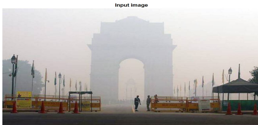
(a) Input Data Image

For qualitative evaluation we compared our results with [9], [14], [15] and [17] methods. Our proposed method dominates all the previous methods in terms of qualitative evaluation. The qualitative results of our proposed method are shown in Figure 3 with different data images.