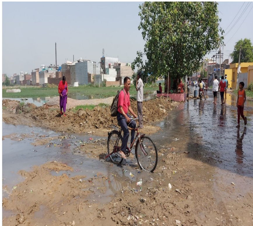
Figure 1: Industrial water pollution threatens residents in Haryana's Panipat Area

These pollutants include heavy metals, dyes, organic compounds, and other chemical byproducts generated during industrial processes. Such effluents not only contaminate surface water sources but also seep into groundwater reservoirs, posing a significant threat to both aquatic ecosystems and public health (Dubey, S. K., Yadav, R., Chaturvedi, R. K., & Yadav, R. K. 2010). The discharge of untreated or inadequately treated wastewater contributes to the depletion of oxygen levels, alteration of pH levels, and accumulation of toxic substances in water bodies, leading to biodiversity loss and ecological imbalance. Moreover, the contamination of groundwater jeopardizes the safety of drinking water supplies for local communities, exacerbating health risks such as gastrointestinal illnesses, respiratory problems, and even chronic diseases. Despite regulatory measures in place, the rapid industrialization and inadequate wastewater management infrastructure in Panipat District continue to exacerbate the problem, necessitating urgent interventions to mitigate the adverse impacts of industrial wastewater pollution on the environment and public health (Hakeem, K. R., Bhat, R. A., & Qadri, H. -2020).