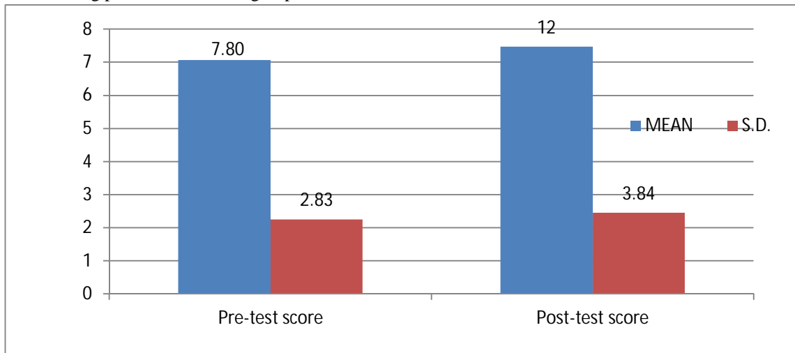
Fig.1 Bar diagram of Mean and S.D. difference between the pre-test and post-test scores of Experimental group on rifle shooting performance Test

Table no-2 reveals that the mean of pre-test score and post-test score Experimental group are 7.8 and 12, and their calculated 'T'-value is 3.62* which is greater than that of tabulated value 2.04 (28) df at the 0.05 level of confidence. It indicates that there is significant difference between the pre-test score and post-test score of the experimental group. Therefore, it is indicated that there is significant difference found before and after the dry fire practice program to the experimental group. It was indicated that before training the rifle shooting performance of the group was below level.